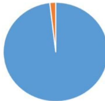
Who Keeps NEST Running?

NEST had 4 paid staff members to drive the mobile class-rooms and provide consistent relationships for the children NEST serves, but the MAJORITY of activities for NEST is lead by volunteers!